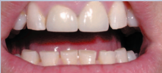
Bruxing can wear down and destroy your teeth.

D oes your jaw feel stiff or do you have difficulty opening your mouth wide? Are your teeth sensitive to cold drinks? Do your jaw muscles feel tired in the morning? You may be grinding your teeth at night (a medical condition called bruxism) or you may be clenching your teeth, which can be just as harmful. People with nighttime grinding habits may wear away their tooth enamel “ten times faster” than those without “abusive chewing habits.” 1 Eventually, your teeth may be worn down and destroyed.